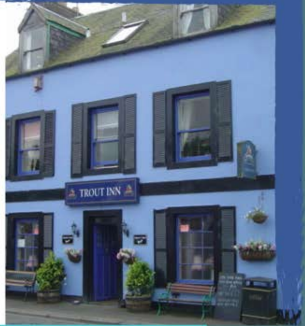
Proposed Second Floor